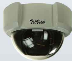
MDS204VP VANDAL PROOF MINI DOME CAMERA 1/3" Color Vandal Proof Dome Camera, 420 TVL, 0.5 lux/F2.0