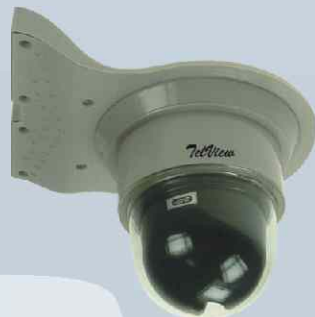
DPC 237 DPC 101