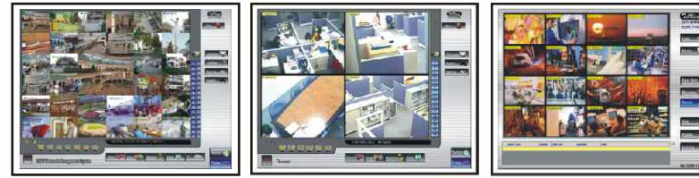
Main Remote Console CNM 7000