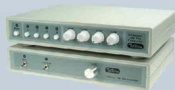
DPC1801-C / DPC1804-C