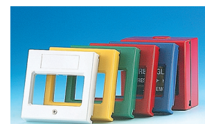
RANGE OF CASING COLOURS White, Yellow, Green, Red, Blue